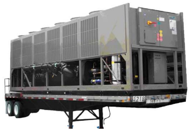
Unit Pictured with Optional Trailer.

Mobile Air Portable Air-Cooled Screw Chiller self-contained rental packages specifically engineered to provide temporary chilled fluid for commercial and industrial air conditioning and process coolina applications requiring Package includes integrally located flexibility. pump matched specifically to range of operation, piping (with pump bypass), triple-duty valves, chilled fluid fittings and in-line water strainers. The chiller package is permanently mounted on an air ride trailer. These features allow for quick delivery and minimal installation time.