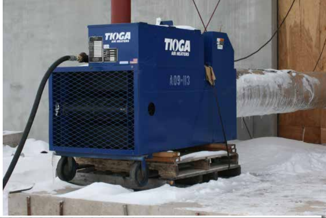
Typical uses for The TIOGA Air Heate